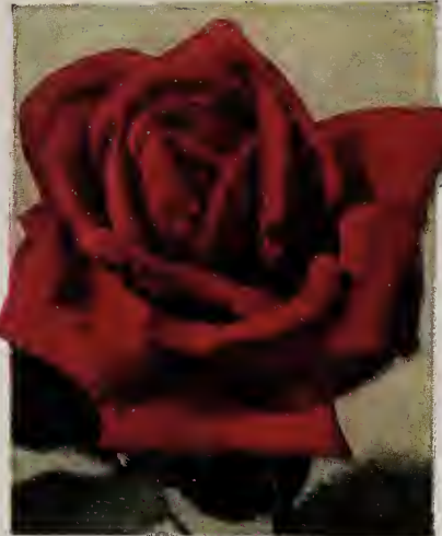
Gruss an Teplitz